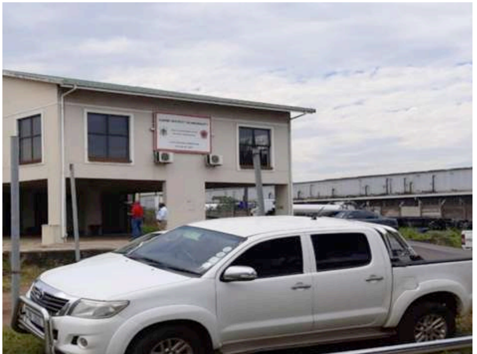
External view of the DMC from the carpark and the unused open ground floor space which lends itself to extended office space